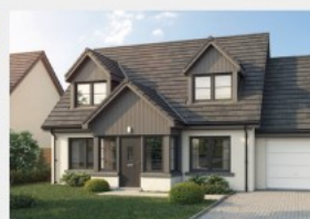
THE BRAMBLES SAUCHEN