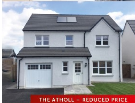
THE ATHOLL - REDUCED PRICE